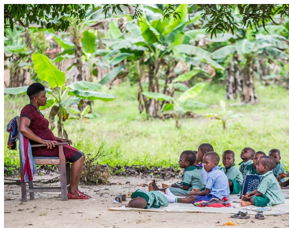
Fourteen kindergarten children at Abuator Primary School in Nigeria study under a mango tree, where they sit on dirty, disused cement sacks on the bare ground. Soldier ants frequently drop from the tree and crawl under the children's clothes, releasing their stinging venom.

Quality education is important in terms of women's equality. It can enable people to challenge social norms, prevent household inequalities from being passed on to girls, and it opens up a wide range of opportunities for women and girls. In addition, free childcare is an essential policy to support women to leave the home to access economic opportunities and participate in public life, including organising with others for better policies. 21 Despite this, only three of the ten countries studied (Brazil, Ghana and South Africa) are providing adequate resources to education and only five (Brazil, Liberia, Senegal, Nigeria and South Africa) are supporting childcare for children under three.