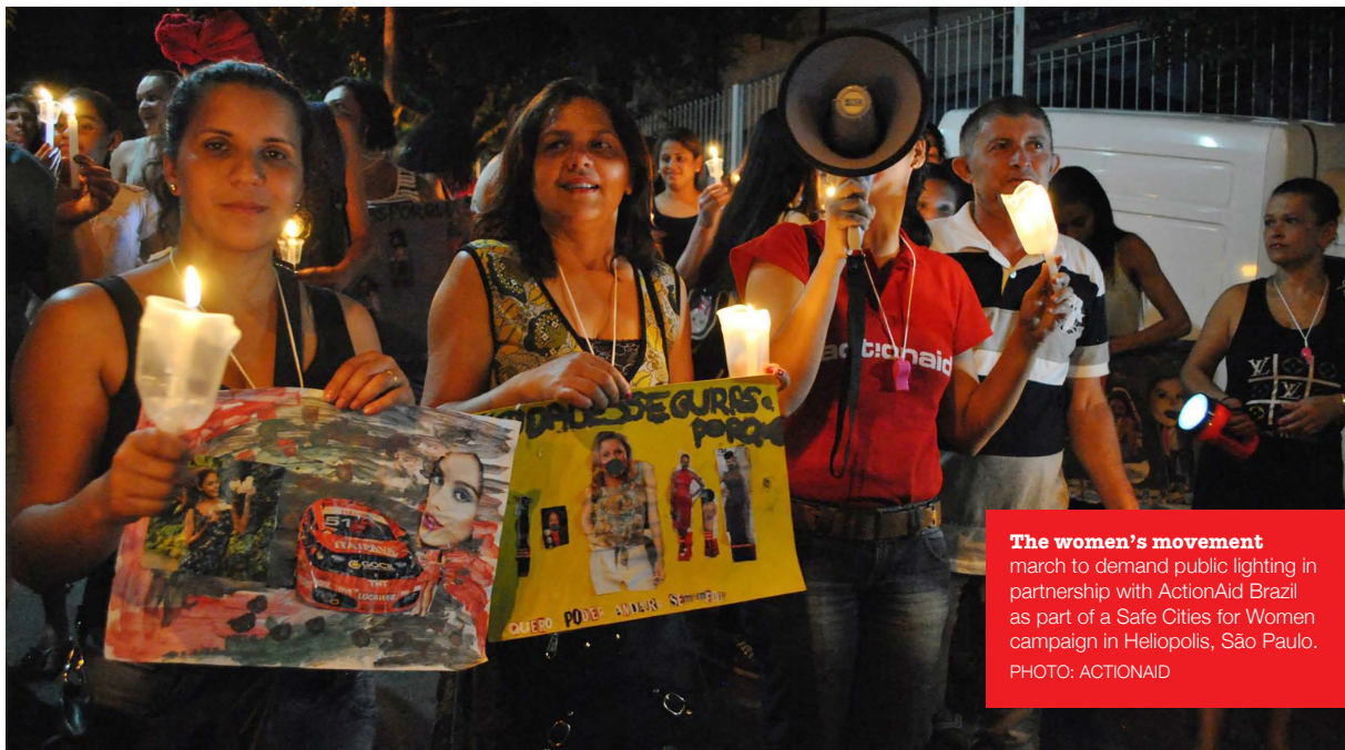
The women's movement march to demand public lighting in partnership with ActionAid Brazil as part of a Safe Cities for Women campaign in Heliópolis, São Paulo.

discrimination against women). The law also promoted the adoption of gender diversity discussions in schools, gives lesbian couples the option to adopt or get married, and increases jail time for crimes against pregnant women, girls under 14, women over 60 and people with disabilities. The increase in reported cases of sexual violence suggests that the situation is getting worse, especially for black women, but also that it is becoming more visible. 126 The next step is to address violence against women and girls in public services to ensure women can safely use economic opportunities, and have safe access to transport.