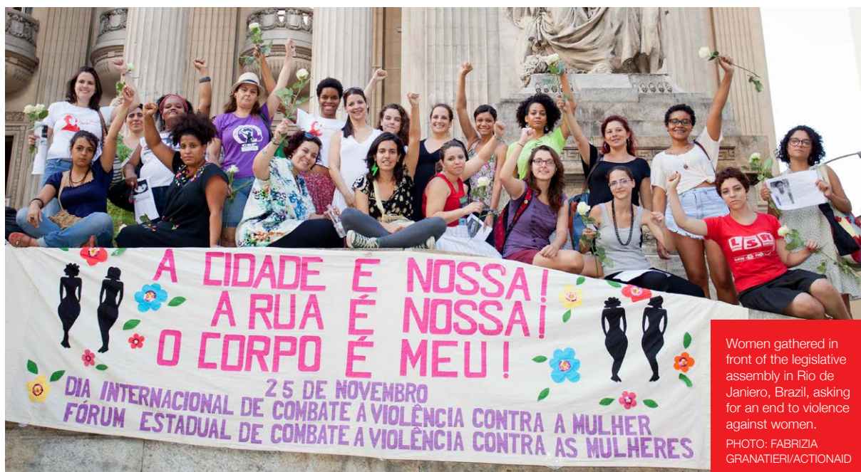
Women gathered in front of the legislative assembly in Rio de Janeiro, Brazil, asking for an end to violence against women.

Yet women's ability to take action against this violence is often greatly restricted. Women in Busiki, Uganda, commented on corruption within the police system, failures in record-keeping and in following up cases and poor enforcement of laws. In Haiti, participants in the women's focus group talked about how disadvantaged they are in comparison to men in terms of access to justice. Even when they have been victims of violence, it is difficult to report crimes to the police and access justice as they don't have sufficient money to bribe those officials. Across the study countries, even though some women's organisations have been providing support to women and girls that have been affected by violence, more efforts are needed to put an end to the corruption within the justice system itself and to make it more responsive to women's conditions or situations.