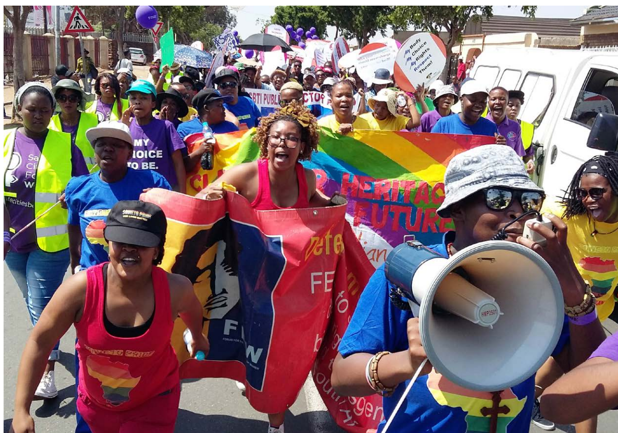
Activists march through the streets demanding equality and an end to homophobia and prejudice during the annual Soweto Pride, South Africa.

the gap between the legal framework and reality'. 22 ActionAid research in Not Ready, Still Waiting examined the extent to which countries are "policy ready" to achieve sustainable development goals around inequality, and analysed the blockages at the national level which prevent the establishment of laws and policies that would reduce inequalities from being put in place. 23 South Africa is, on paper, the most policy ready of the countries ActionAid studied to address gender inequality, with 90% of key policies in place. 24 However, the lived reality of women is different; they continue to experience inequality on multiple levels. A recent survey showed that 52% of women in Gauteng, the most populous province in South Africa, had experienced sexual violence. And yet, continued attempts to hold the government to account for escalating violence by LGBTI women are deflected by the government, which simply references the country's "most progressive" constitution. 25