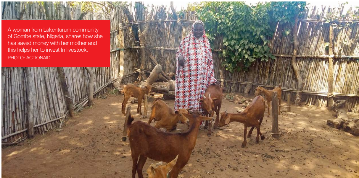
A woman from Lakenturum community of Gombe state, Nigeria, shares how she has saved money with her mother and this helps her to invest in livestock.