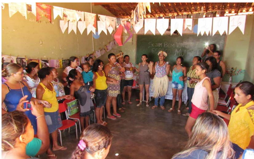
Focus group discussion on gender and inequalities with the Remanso's Women Network, Brazil.

our eyes'. A further element which builds "power within" is economic independence. A member of a collective in Nyanza, Rwanda highlighted that women's increased access to resources as a result of being part of a collective had helped them to shift power, 'groups have also become formal community organisations with functional governance structures led exclusively by women and well respected by members of the community. Cooperatives act therefore as legitimate power spaces that are also contributing to changing the community views about the power that women hold.' 14