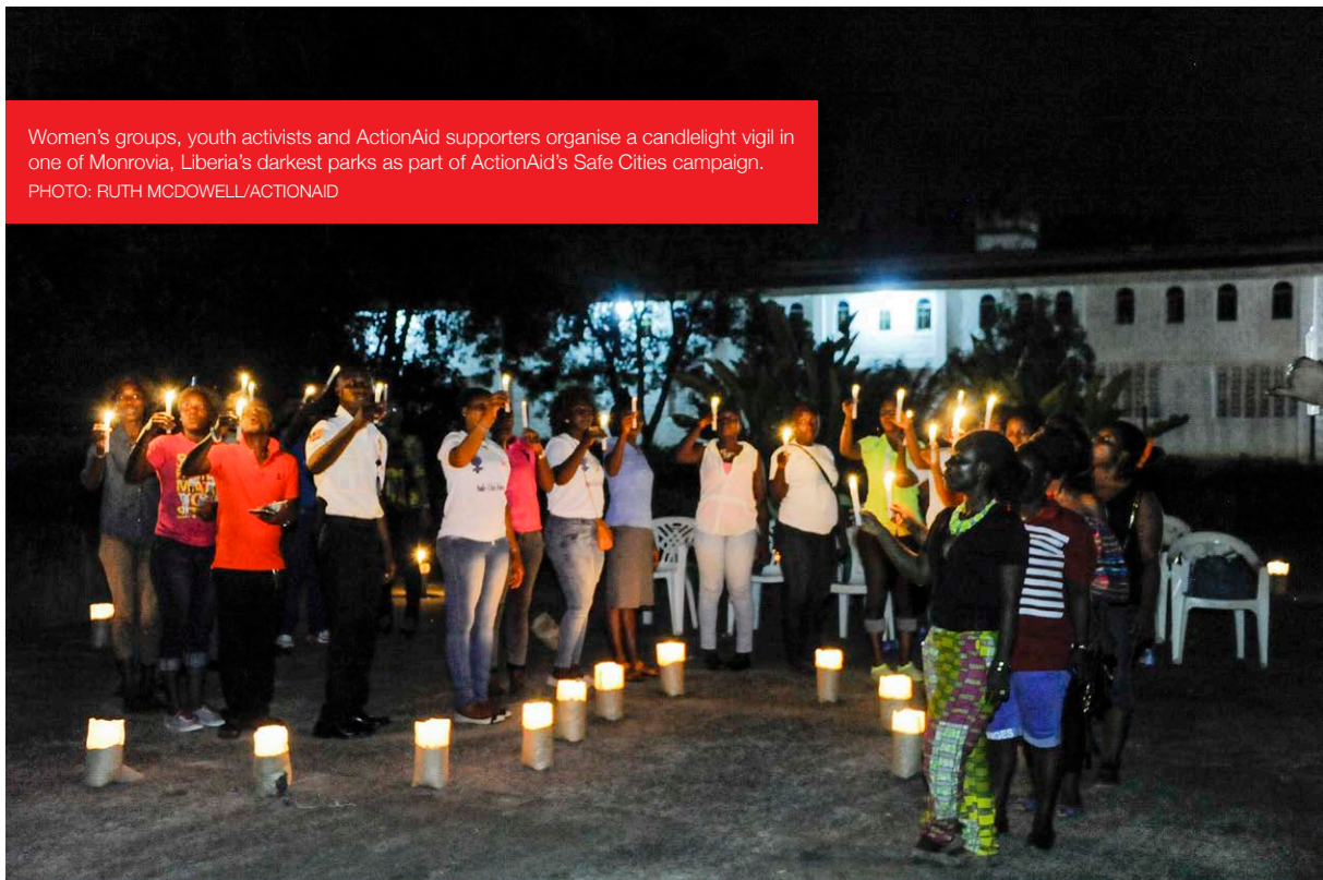
Women's groups, youth activists and ActionAid supporters organise a candlelight vigil in one of Monrovia, Liberia's darkest parks as part of ActionAid's Safe Cities campaign.

making linkages amongst groups it is important to acknowledge that not all women's organisations will be working to advance progressive political values. As the ActionAid facilitator in Haiti warned, 'strengthen [only those] women's organisations with proven track records of empowering women or mobilizing on women's rights issues'. In both Brazil and Haiti, some women's organisations have been set up as shells, purely for electoral purposes but with no substantive work on addressing inequality.