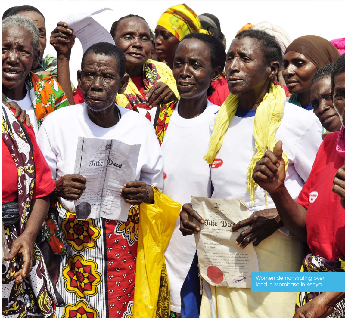
Women demonstrating over land in Mombasa in Kenya.