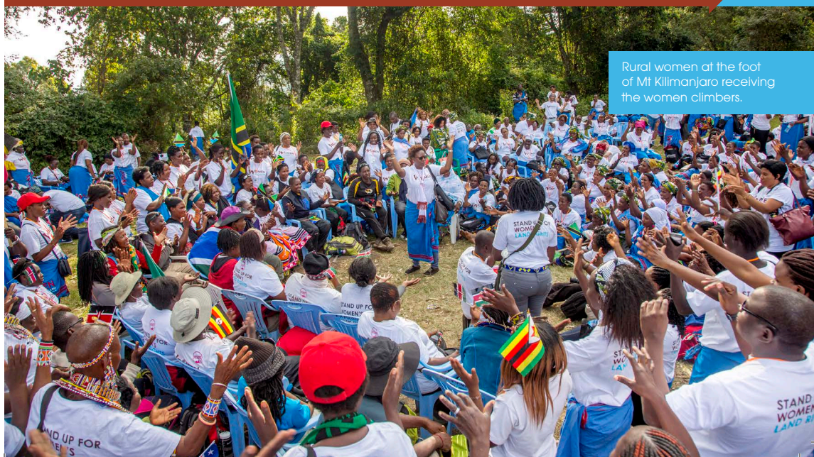
Rural women at the foot of Mt Kilimanjaro receiving the women climbers.

To raise awareness on existing frameworks and safeguards around large scale land based investments and demand for their application in securing legitimate tenure rights of rural women in Africa.