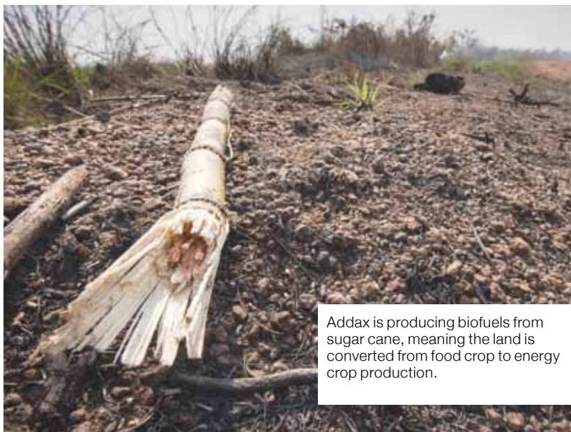
Addax is producing biofuels from sugar cane, meaning the land is converted from food crop to energy crop production.

The 2013 report for Swedfund also concluded: "The overall performance of the FDP in terms of sustainability cannot be gauged until sometime after it has been implemented for all sites within the project area." 43 This brings into question as to how the RSB was able to award a sustainability certificate for the project.