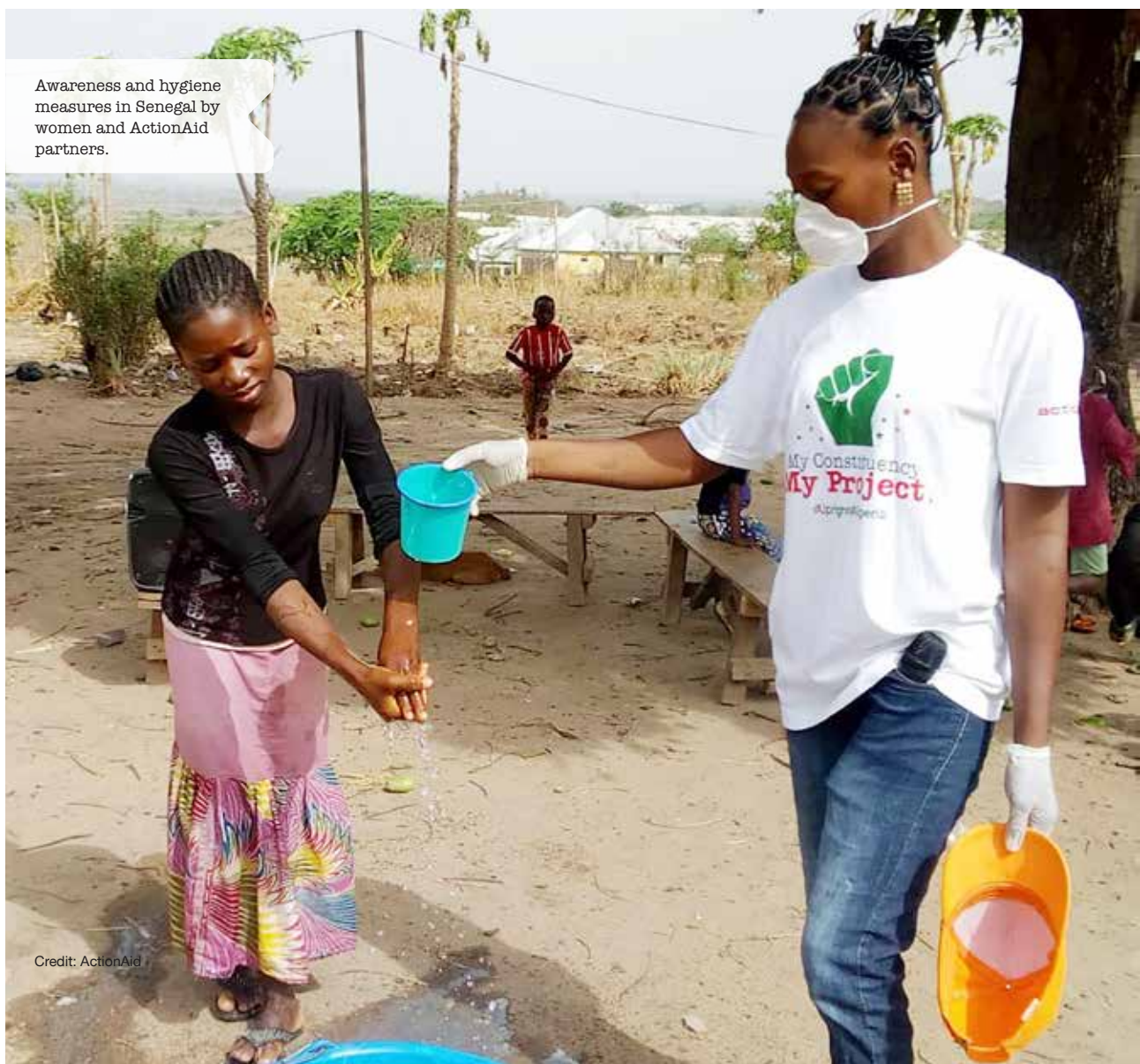
Awareness and hygiene measures in Senegal by women and ActionAid partners.