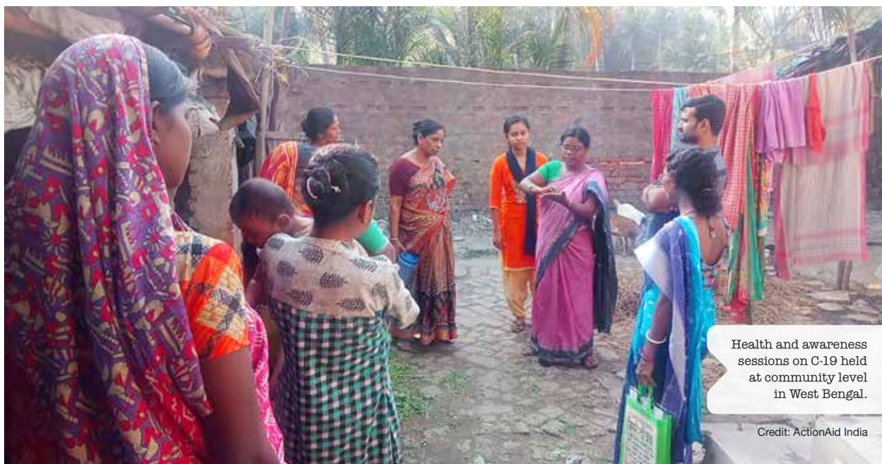
Health and awareness sessions on C-19 held at community level in West Bengal.

Women have specific needs connected to their sexual and reproductive health (SRH), which are often deprioritised during humanitarian crises – and specifically epidemics. 30 For example, over 2013 – 2016 in Sierra Leone during the Ebola outbreak, more women died of obstetric complications than of the infectious disease itself. 31 There is a further danger that, as health resources are diverted to address the pandemic, existing health services, including those for maternal health, are disrupted. According to UN Women, evidence from Ebola and Zika shows that efforts to control outbreaks often divert resources from routine SRH services including pre- and postnatal healthcare and birth control. 32 There are also examples of C-19 being used as a reason to roll back women’s access to SRHR services, 33 and further risk of abusive partners using access to healthcare as a form of control.