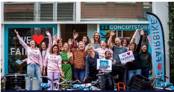
We campaign to raise awareness about the negative social and environmental impacts of e-bike supply chains.