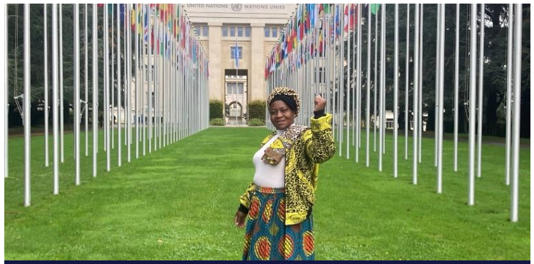
Together with activists like Monica, we advocate for binding policies to protect women's rights in supply chains.